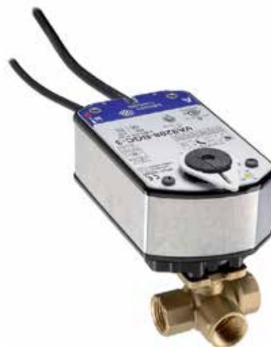
VA9208 mounted on VG1000